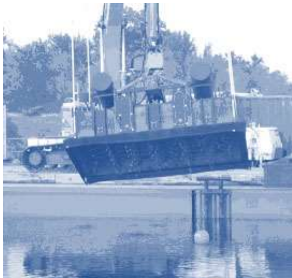
Figure 3. Mixing devices for roto-tiller delivery of AC into Grasse River sediment were mounted inside an enclosure to minimize re-suspension of sediment.

In addition to assessing reductions in PCB bioavailability, the pilot study is evaluating methods for in-situ delivery of AC to river sediment and determining the extent of PCB and sediment release to river water during applications. Delivery/mixing equipment includes a specially designed roto-tiller with and without rotating tines (Figure 3) and a tine sled, both enhanced with nozzles to inject AC directly into the upper sediment.